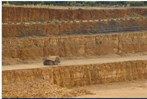
LIME & GYPSUM