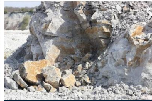
MINING & MINERALS